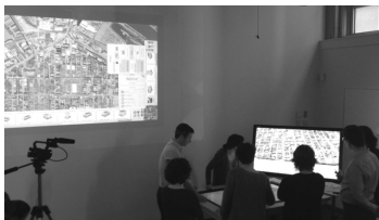
Figure 4: Projection onto the wall for larger audience