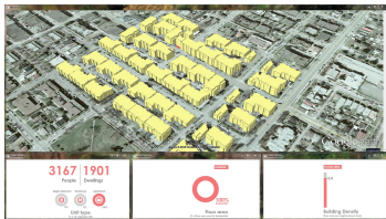
Figure 2: 3D pattern viewer