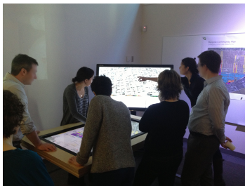
Figure 3: Collaboration around horizontal and vertical displays